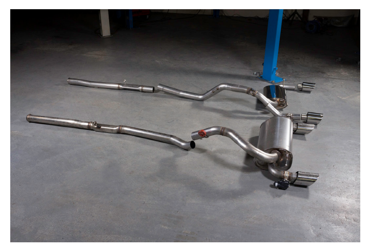
Lay the Scorpion system out next to the original, to help get an understanding of how it will piece together on the car.