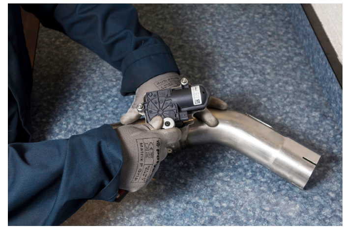
If your vehicle comes fitted with an electronic exhaust valve, you may need to transfer this over from the factory system to the Scorpion. Detailed instructions for this are provided with the product.