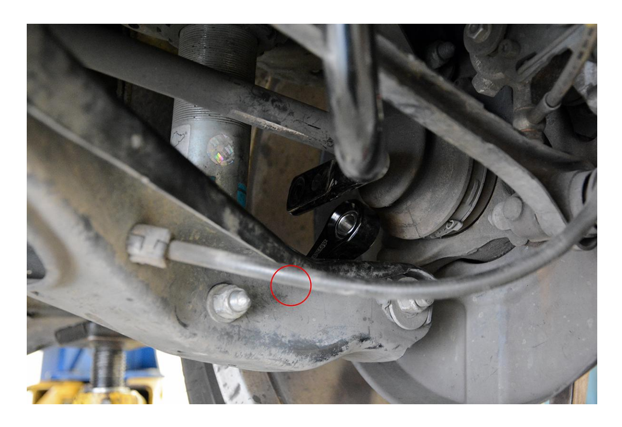
Step 4 – Install spacers into the top of the Spherical Sway Bar End Link. Secure to the sway bar using the supplied M10x55 Bolt, M10 Washer, and M10 Lock Nut. Torque to 55 Nm.