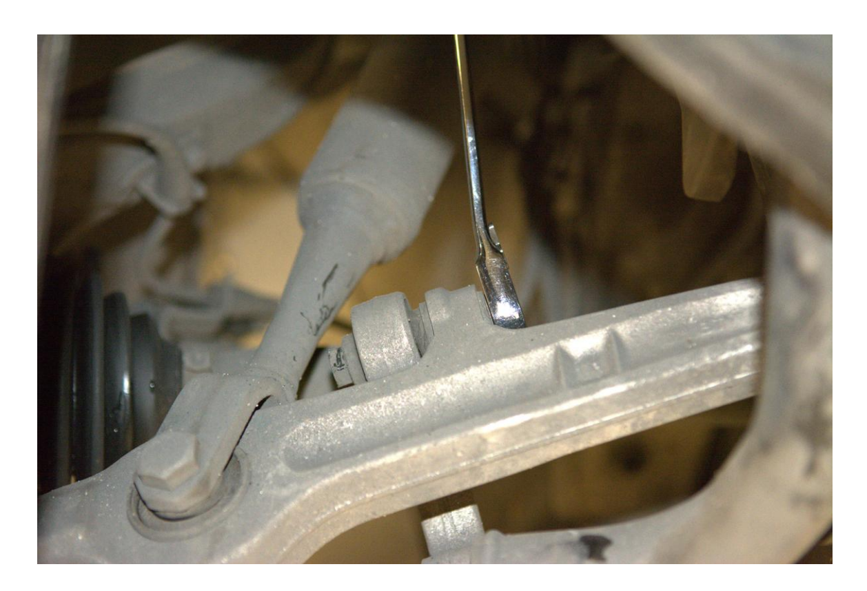
Step 4 – Remove the factory front sway bar end links. Pat yourself on the back; you're halfway done! With the stock end links removed, the 034Motorsport Billet Aluminum Spherical Front Sway Bar End Links can be installed using the supplied hardware. You'll need a 16mm wrench for the supplied bolts and 15mm wrench for the supplied locknuts.