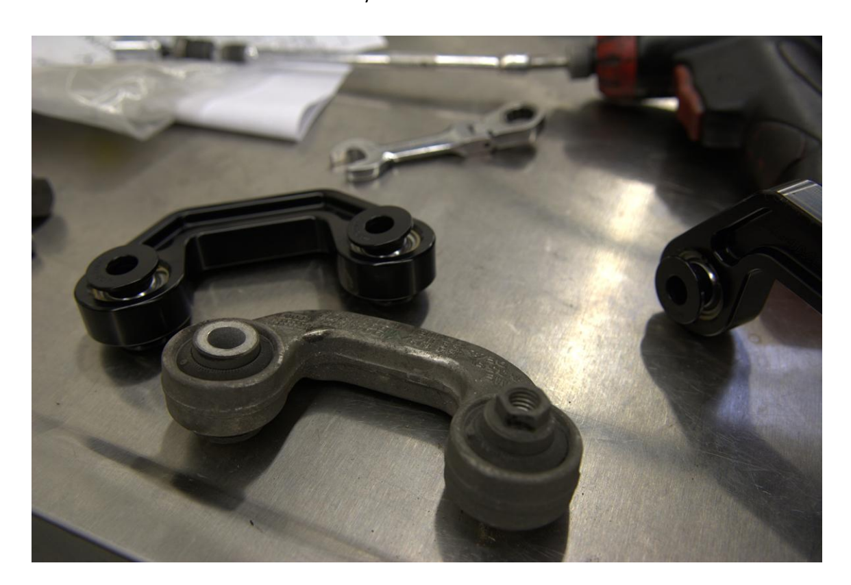
Step 6 – Install the 034Motorsport Billet Aluminum Spherical Front Sway Bar End Links with the lower bolts in first, with the supplied washers between the bolts and end links. On B6/B7/C5 cars, the supplied M10x50 bolts thread directly into the sway bar. On the B5, the supplied M10x55 bolts go through the sway bar and are secured using the supplied M10 locknuts. Make sure to use the correct length bolt for your vehicle to ensure proper thread engagement!