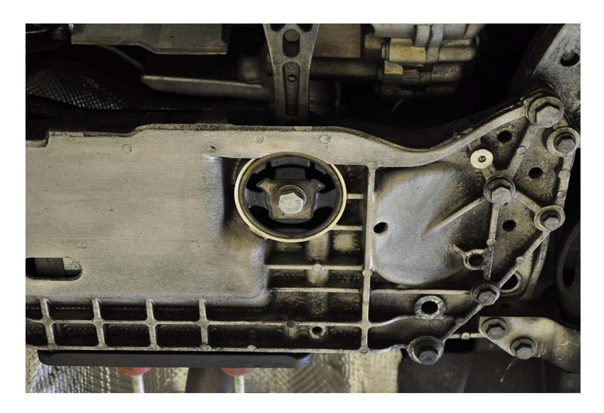
Step 2 – Using a 21mm socket, remove the factory bolt completely in order to install the 034Motorsport Dogbone Mount Insert.